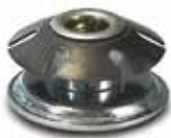
Metal Threaded Inserts