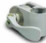
Accessory Clamp for Designer Panel System