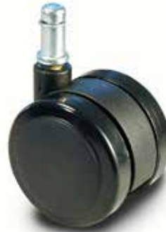
Hooded & Unhooded Twin Wheel Casters

Every employee is viewed as integral to our team, possessing unparalleled knowledge of our core manufacturing processes, including injection molding, progressive metal stamping, eyelet metal stamping, and precision assembly.