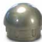
Standard Plastic Caps