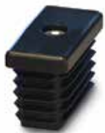
Plastic Threaded Inserts