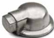
Die Cast Custom Mount