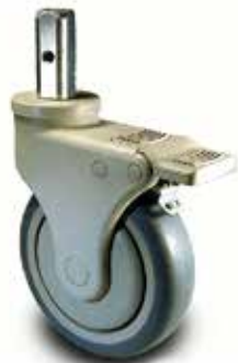
Medical/Polymer Industrial Casters