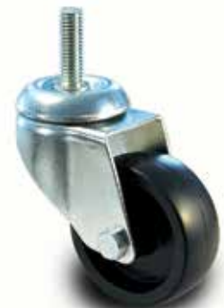
General Duty Industrial Casters