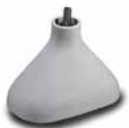
Designer Panel System Base Feet