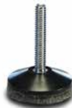
Adjustable Glides with Felt Base