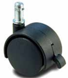
Twin Wheel Casters with Special Braking Options