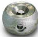
Knurled Locking Ball