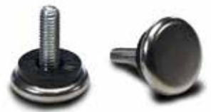
Adjustable Glides with Metal Base