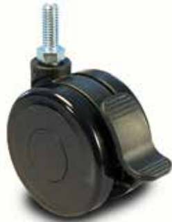
Riveted Heavy Duty Twin Wheel Casters