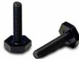
Adjustable Glides with Plastic Base