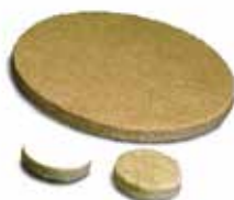
Stick-on Felt Pads