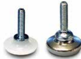
Adjustable Glides Emperor & Empress Swivel & Non-swivel

Carpin offers an unmatched assortment of adjustable glides that compensate for uneven flooring surfaces and also protect flooring surfaces against scratches, marring and abrasion.