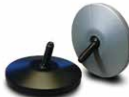
Adjustable Glides Low Profile Swivel & Non-swivel