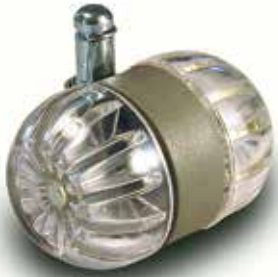
Special Twin Wheel Casters

Carpin casters are found on School and Office Furniture, Point of Purchase (POP) Displays, Medical Carts and Furniture, as well as Industrial Tables and Carts. Our industry knowledge of these unique markets allows Carpin to add value to our customers and enhance the performance of their products.