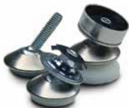
Marquis School Glides