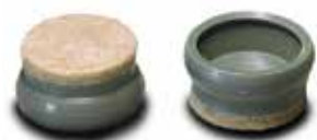
Snap-on Felt Caps

Shown below are representative samples of the many felt and nail-on floor protection products available from Carpin.