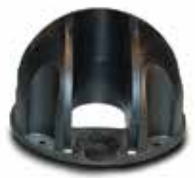
Collapsible Table Leg Hinge