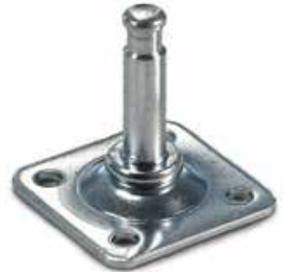
Caster Top Fittings