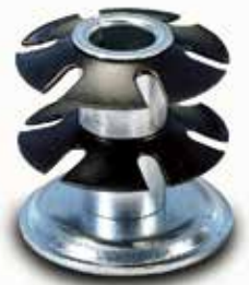
Metal & Die Cast Caster Sockets