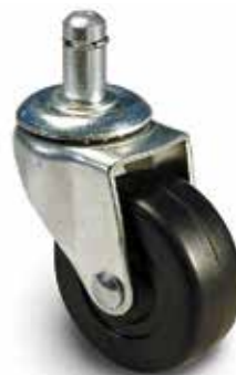
Light Duty Industrial Casters

Carpin manufactures and distributes a variety of single wheel casters found in all types of commercial applications.