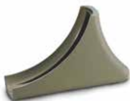
Cantilever Chair Glides