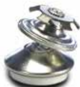
Floor Saver Glide Base