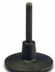
Assorted Adjustable Glides