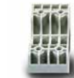
Base Attachment Bracket