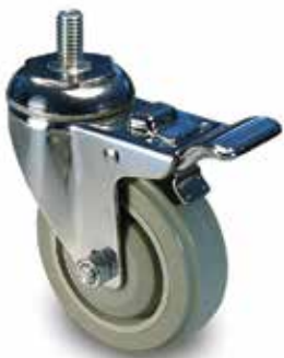
Institutional Industrial Casters

Carpin offers a variety of sockets that enable casters to be attached to the end of metal tubing.