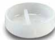
Weld Cup Plastic Inserts