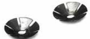
Light Duty Tube Connectors