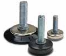
Adjustable Glides Heavy Duty "Hank" Swivel & Non-swivel