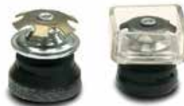
Solo Glide Apollo Banquet and Restaurant Glides