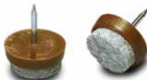
Felt Nail-on Glides