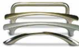
Die Cast Drawer Handles