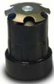
Plastic Caster Sockets