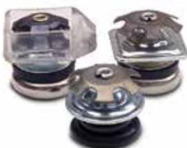
Apollo & Saturn Banquet and Restaurant Glides

Carpin offers a variety of glides that serve to quiet and beautify banquet, restaurant and hospitality furniture. These glides also save money by extending the life of flooring surfaces.