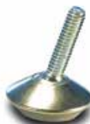
Marquis Adjustable Swivel School Glides