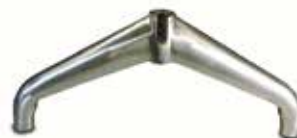
Die Cast Table Base