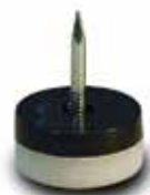
Plastic and Metal Nail-on Glides