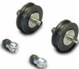
Door Roller Assemblies