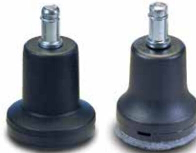
Bell Glides and Solo Glide Bell Glides with Felt