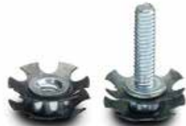
Heavy Duty Tube Connectors & Male Heavy Duty Connectors