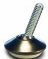
Marquis Adjustable Swivel Glides